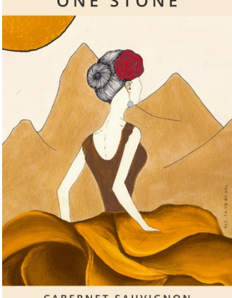
2019 - PASO ROBLES

One Stone is a tribute to the women who move mountains, one stone at a time. In that spirit, we create wines that shine at every occasion. Our grapes come from select sites that exemplify Paso Robles as a world-class region for Cabernet Sauvignon. The resulting wine is sophisticated, elegant and powerful—much like the land and the women from which they come.